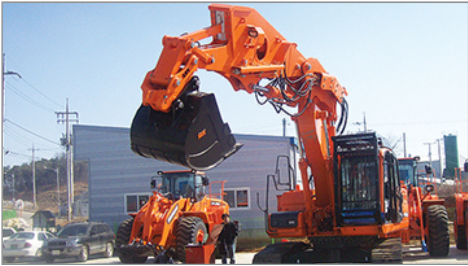
Max. Reach : 8.9m for DX225LC