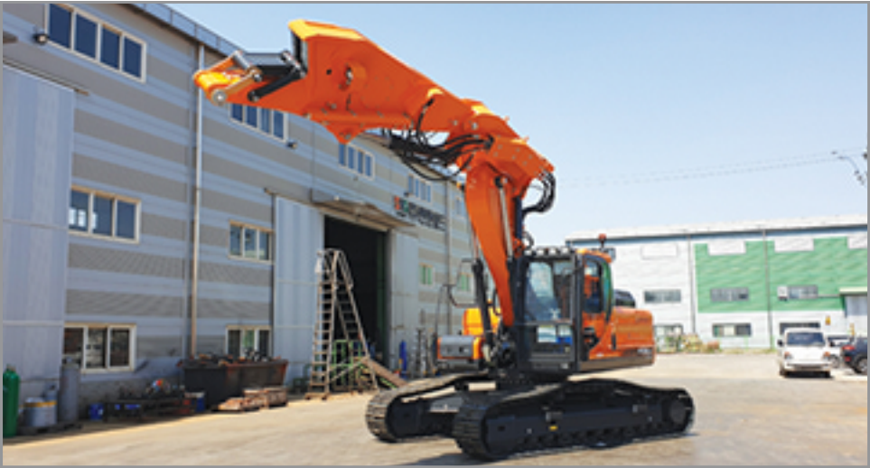
Max. Reach : 9m for DX260LCA