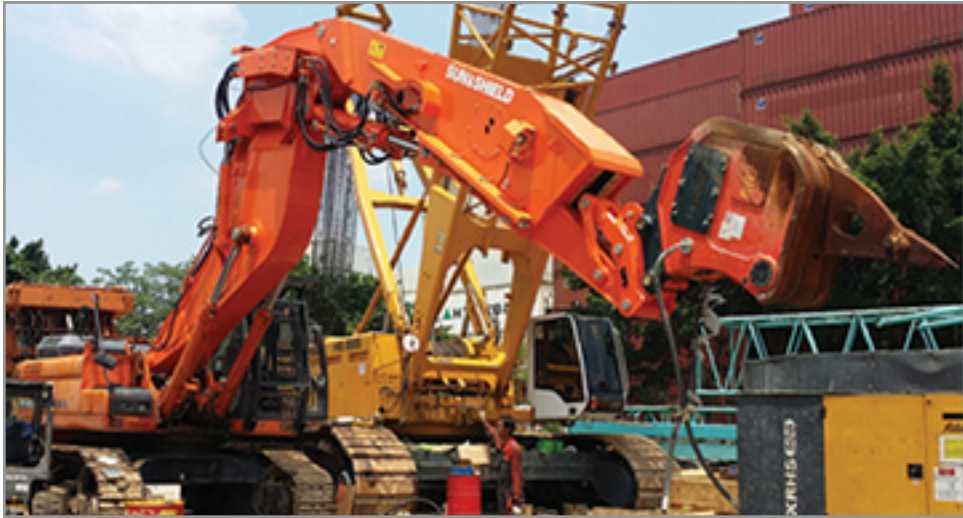
Max. Reach : 10.1m for DX480LC