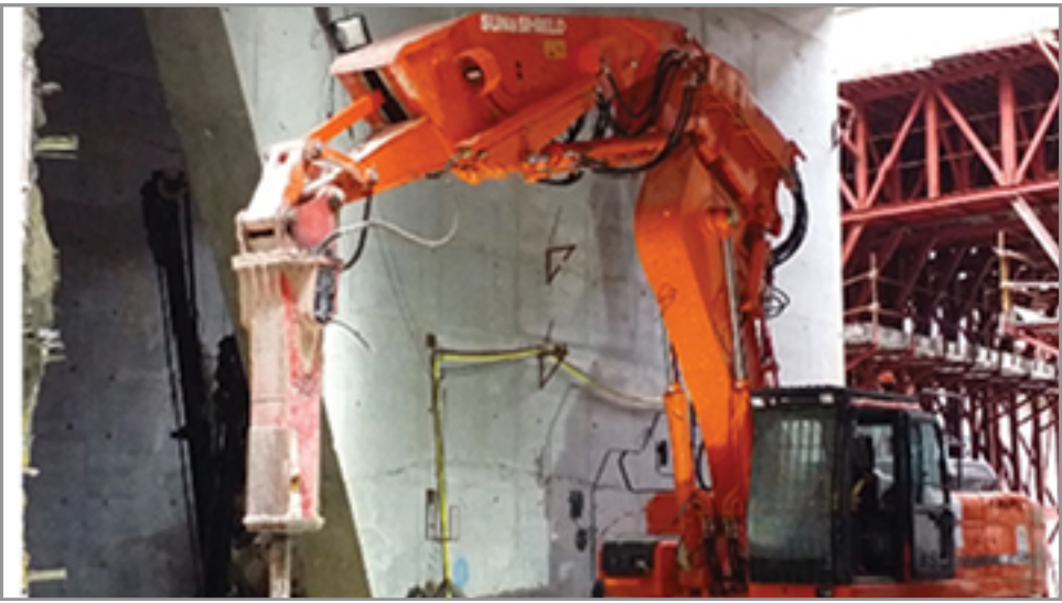
Max. Reach : 9.6m for DX420LC