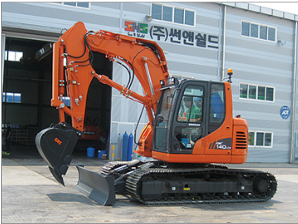
Max. Reach : 6.5m for DX140LCR