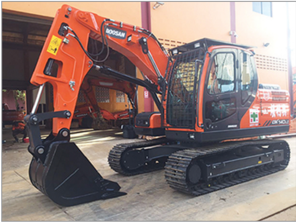
Max. Reach : 6.5m for DX140LC