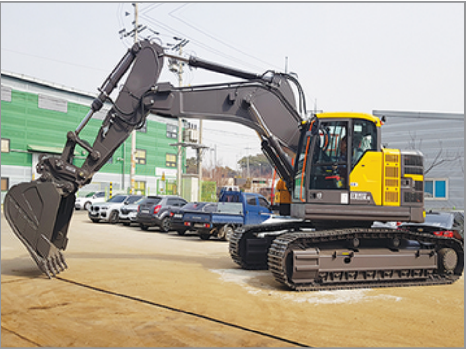
Max. Reach : 8.9m for ECR355ENL