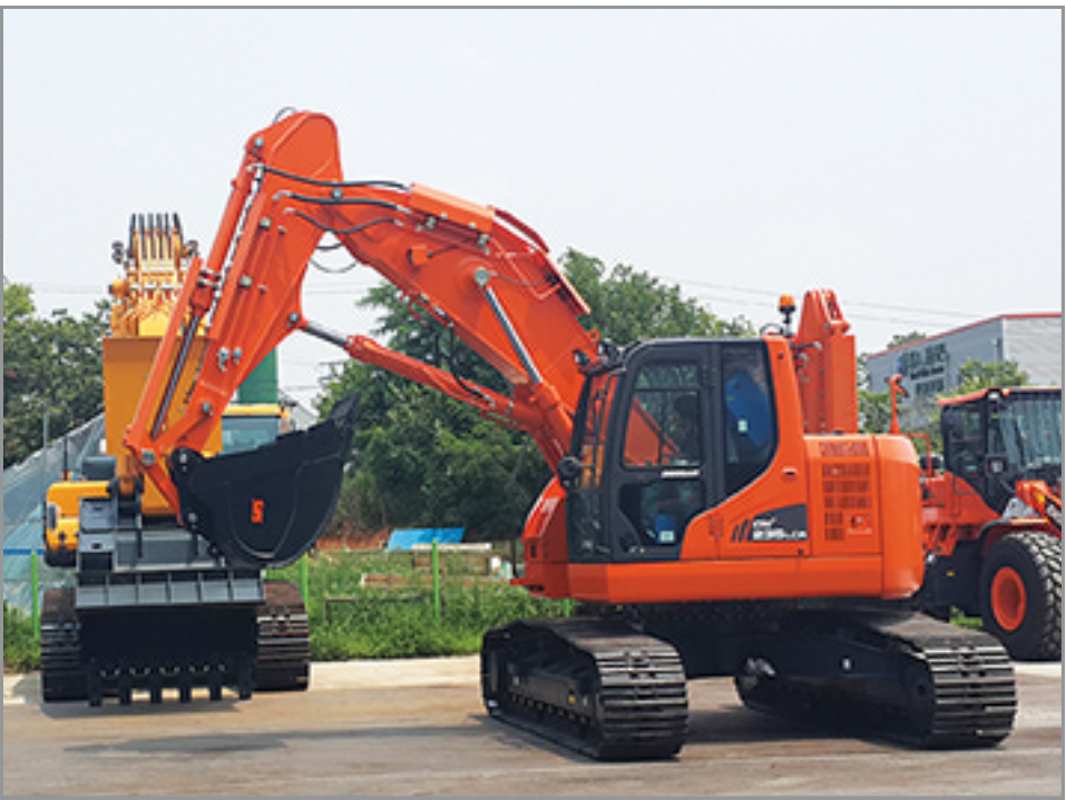
Max. Reach : 7.9m for DX235LCR