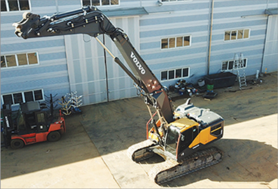
Max. Height : 16.7m for EC300EL