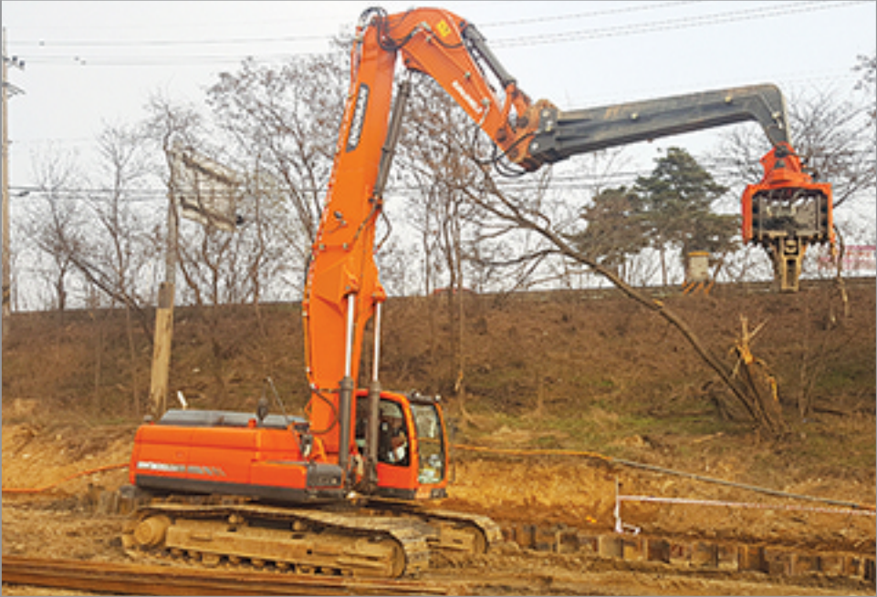
Max. Height : 16.7m for DX300LC-5

Working range shown is a general representation and will vary with machine and attachment size. These details are for guidance only and may be changed for improvement without prior notice.