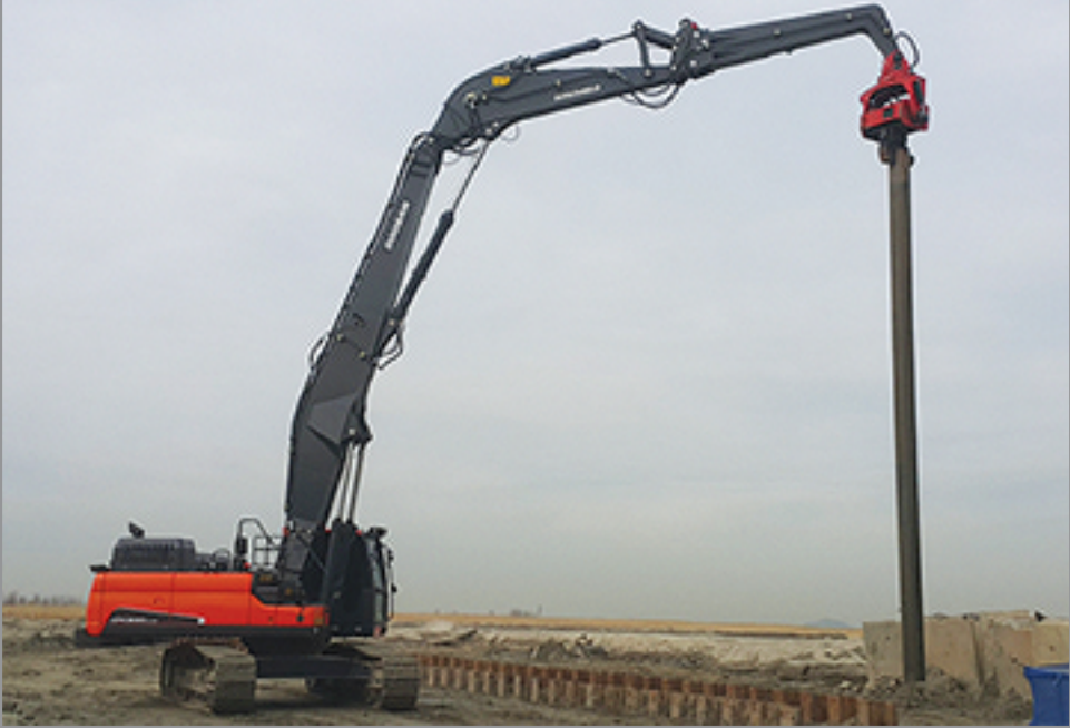
Max. Height : 16.7m for DX300LC-5