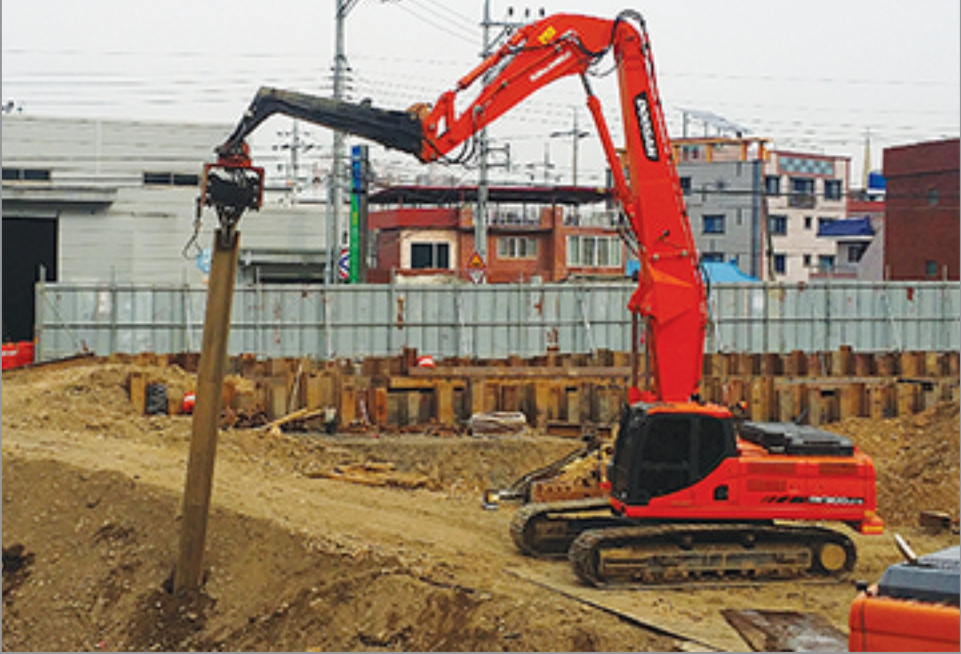
Max. Height : 16.7m for DX300LC-5