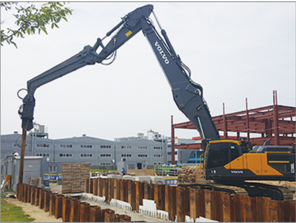
Max. Height : 16.7m for EC300EL