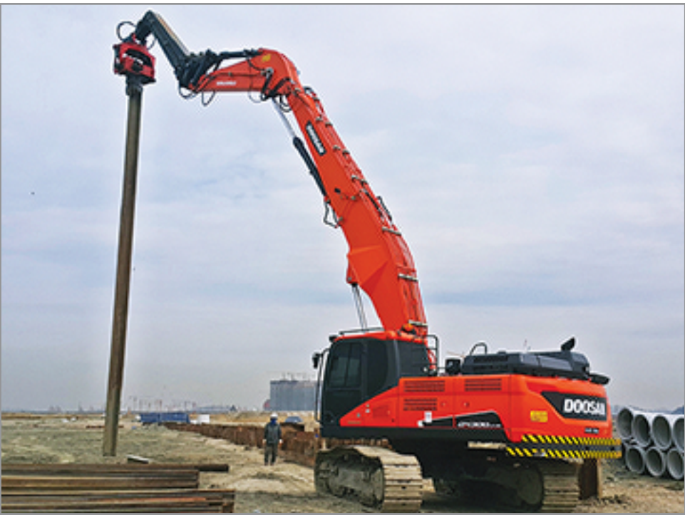
Max. Height : 16.7m for DX300LC-5