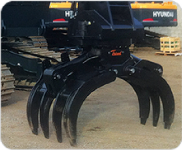
Power Grapple (SPG)