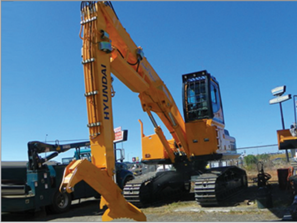
Max. Reach : 11.6m for HX300L(LH Type)