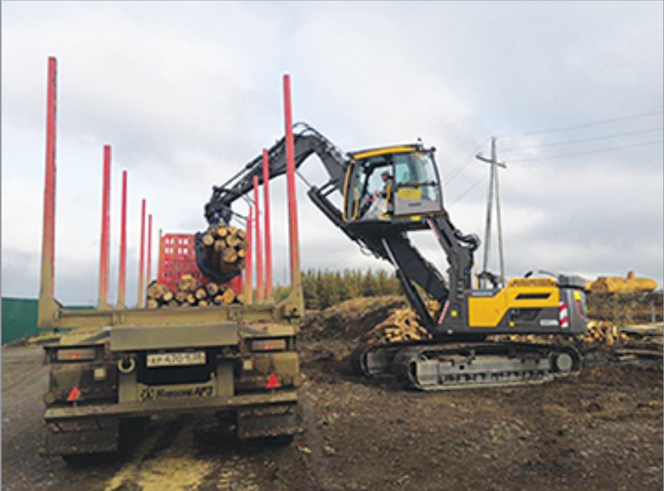
Max. Reach : 11m for EC220D(BL Type)