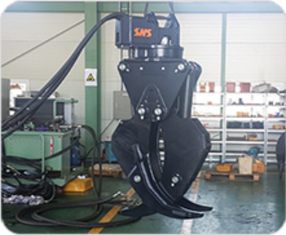
Wood Grapple (SWG-PT)