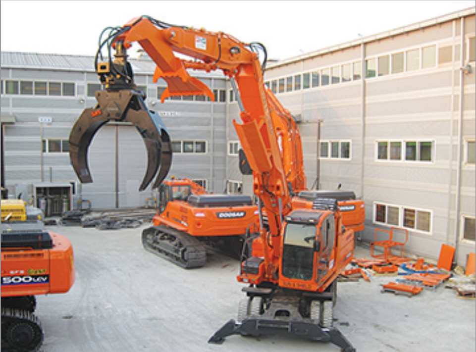
Max. Reach : 11m for DX210WA(LH Type)