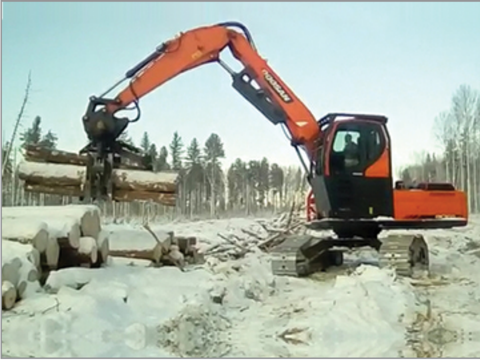
Max. Reach : 11.6m for DX300L(BL Type)

Working range shown is a general representation and will vary with machine and attachment size.