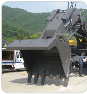
Tilt Dump Bucket