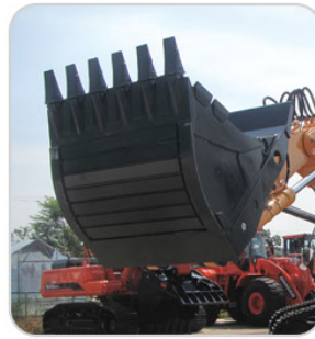
Bottom Dump Bucket